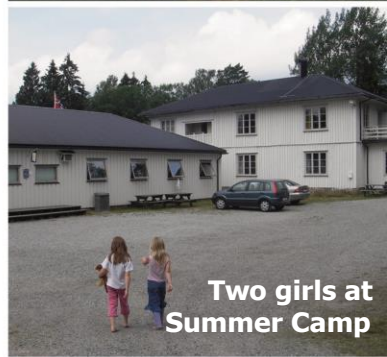
Two girls at Summer Camp